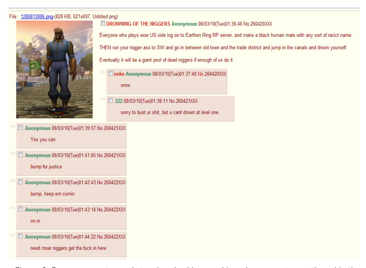
Figure 2. By some counts nearly two hundred brown skinned anon avatars gathered in the city of Stormwind, and ran in a crazed mass through the world annoying and entertaining onlookers.