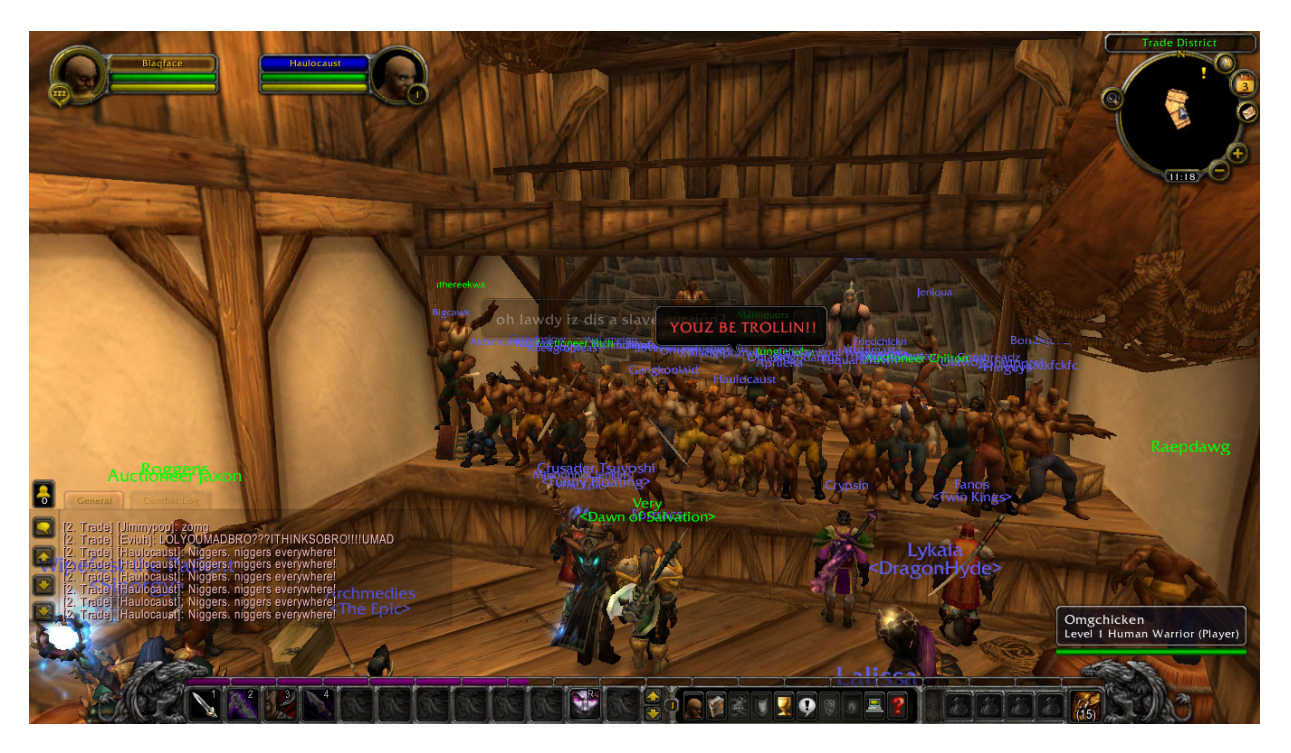
Figure 6. the striking reconfiguration of bodies in space created by the August 3, 2010 World of Warcraft Raid.

seen throughout the city and surrounding areas as players congregate for guild events, general socialization or organization, or for key events like the seasonal holiday quests. Anons deploy brown skin for its attention seizing power due to its relative absence within the game world and its political baggage. They also use tactics tuned to each space. From the virtual sit-in of a Habbo pool's closed raid to the less focused and playful spontaneity of the WOW /b/lackup raids, these differences illustrate some key variables and how games each offer their own contexts in which to work. Habbo's restrictive collision detection and pathing, as well as its limited scope, became assets and integrated into the tactics of the raid. WOW's sprawling nature and more free form spatial navigation necessitates more mobile activities that travel through space forming crowds. The transitory nature of these WOW raids thus open up the possibility for rare virtuosic moments of engagement and reflection. If nothing else, they make players conscious of the multi-layered mediation of race in gamespace from code to discourse.