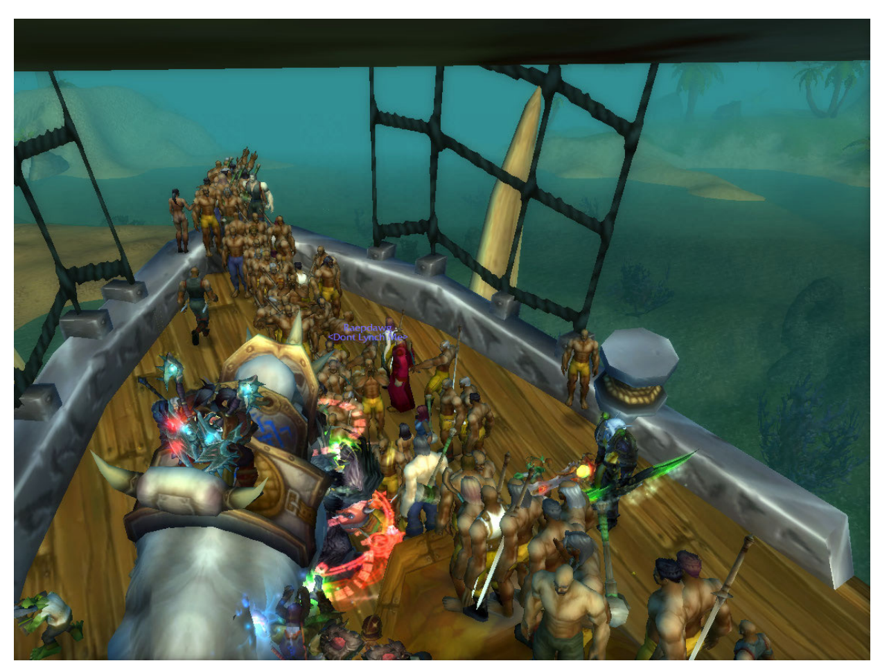
Figure 4. The mass of nigras embark on a cross-continental journey involving a boat ride which doubles as a slave ship

A mere week after the August 3, 2010 raid it was almost completely forgotten. There was a YouTube video with just under four hundred views and thirteen comments, but it is now removed (Figure 5). Little mention was made of the raid the following day. Its existence was limited to its happening. But this doesn't mean it was without impact. It is exactly this ephemeral, temporal experience that makes these raids compelling. They transform space, troll, and, most importantly, challenge and reveal the racial boundaries of the community.