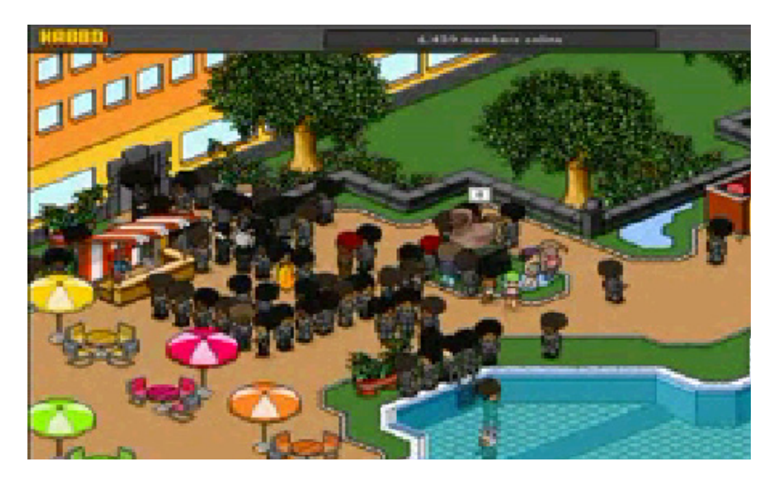
Figure 1. The users entered the world and selected characters with suits, dark skin, and afros, referred to themselves as 'nigras,'

Habbo Raid of July 2006,' n.d.). Responding to alleged banning of black avatars by Habbo moderators, users of the message board 4chan.org organized a massive disruption of the Habbo community. The users entered the world and selected characters with suits, dark skin, and afros, referred to themselves as 'nigras,' and stormed one of Habbo 's most popular social destinations, the pool. There the raiders shouted racial slurs, formed swastikas with their bodies, and blocked access to the pool and other popular spaces using Habbo 's collision detection to effectively trap other users (Figure 1).