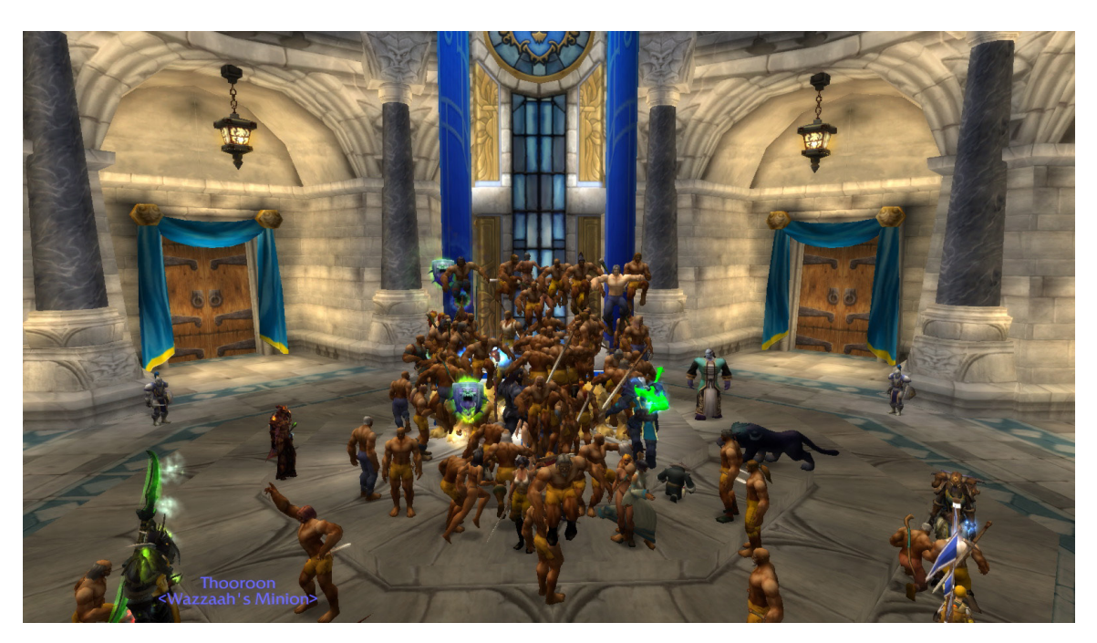
Figure 3. '...a spontaneous call to arms on /b/, a prompt assembling of brown skinned and inappropriately named level one humans in the Alliance capital city of Stormwind.'